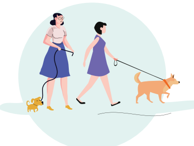
DOG WALK PARK