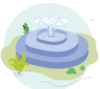
WATER FOUNTAIN & KUND