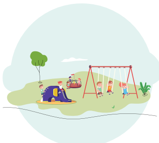
LARGE CHILDREN'S PLAY AREA