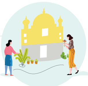
GURUDWARA & WORSHIP HALL