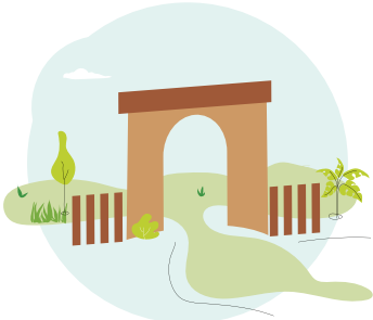
CENTRAL GREEN BOULEVARD

Live amidst the finest amenities in your meticulously designed neighbourhood, be it the integrated green network comprising of a central green boulevard and English-style courts or other world-class amenities like a school and clubhouse. Add to it a police station and a fire station and you know that you are living in a complete ecosystem here.