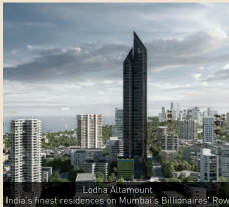
Lodha Altamount India's finest residences on Mumbai's Billionaires' Row