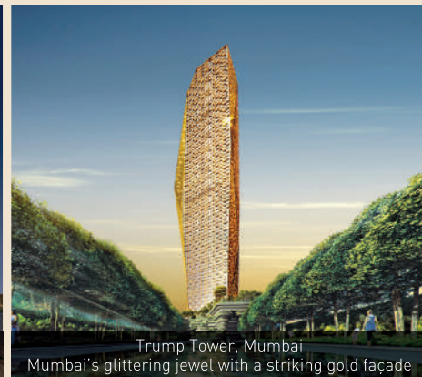
Trump Tower, Mumbai Mumbai's glittering jewel with a striking gold façade

Whether it's giving India some of its most iconic addresses, or crafting one of the world's most coveted residences in London; adding a glittering icon to Mumbai's skyline or creating designer residences for Mumbai's glitterati; delivering meticulously designed offices for distinguished clientele or conceiving India's No.1 smart city with the highest liveability quotient† - one name is transforming the way we live with landmarks at par with the world's best: Lodha.